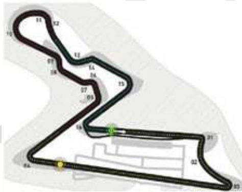
Buddh International Circuit