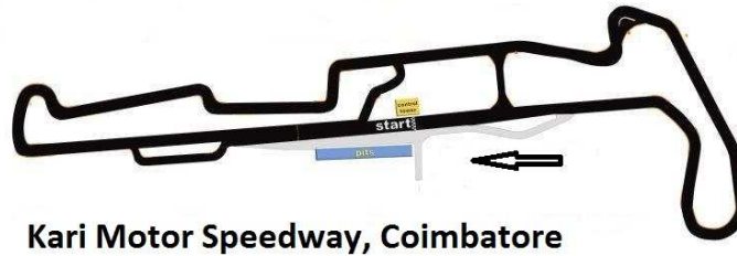
Kari Motor Speedway, Coimbatore