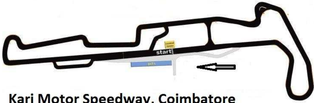
Kari Motor Speedway, Coimbatore