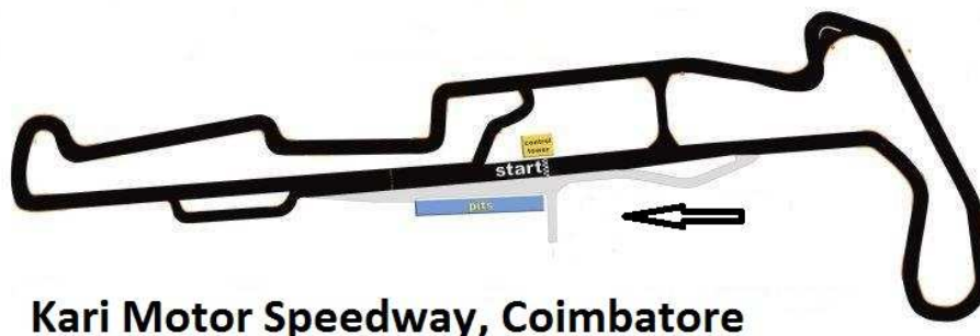
Kari Motor Speedway, Coimbatore