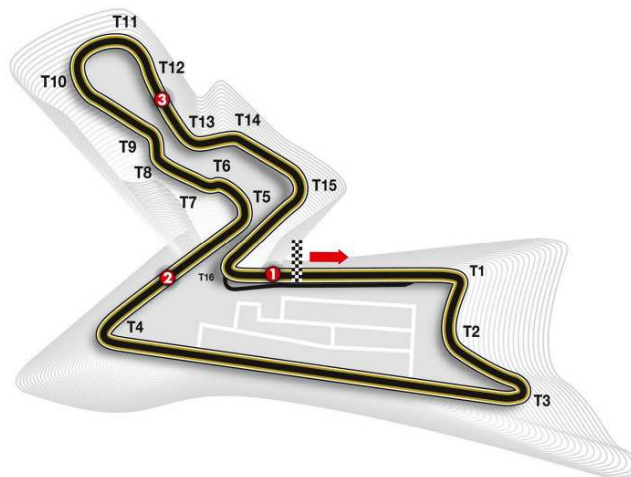
Buddh International Circuit, Greater Noida